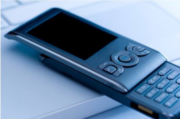
High temperatures are no problem for Zytel® HTN.