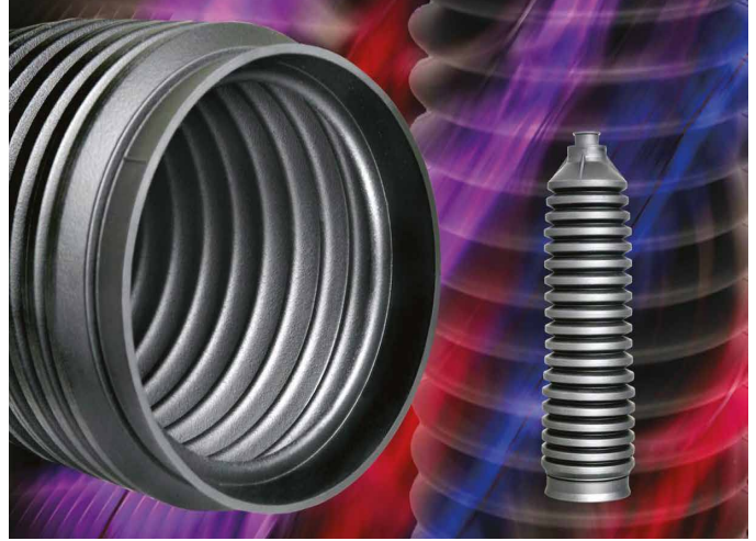
"PRESSBLOWER manufacturing process photo courtesy of Ossberger GmbH. For more information. Please visit http://www.ossberger.de .

When looking to develop under-chassis sealing systems with outstanding performance and cost reduction opportunities, companies turn to the proven performance of Santoprene TPVs.