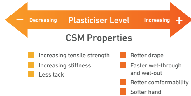
Wetting by Styrene

The speed and degree of the wetting behaviour of CSM in styrene is a critical metric. The graph below shows the positive performance synergies of a Celanese binder and sizing system versus competitive chemistries.